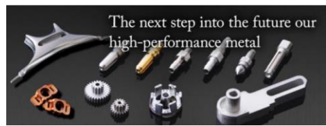
The next step into the future our high-performance metal