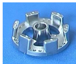
Net shape products of soft magnetic material with complex geometry

When you think about mass production of components with high dimensional accuracy, please ask us for more information.