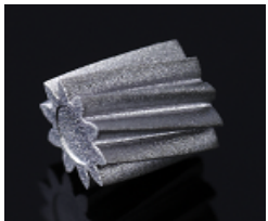
Helical Gear O.D. 2mm, Height 3mm