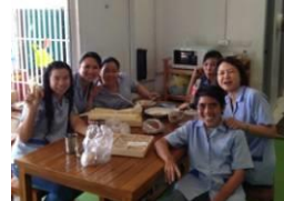
Thai plant (left) and the staffs (right)