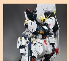
My favorite v Gundam