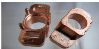
▲Copper electronic components by MIM

This time, we will introduce copper products. Copper is a metal that is an excellent conductor of both electricity and heat, and is used in electronic equipment and other various applications. At Taisei Kogyo, we have received many requests for consultation in relation to mass-production problem using cutting such as, poor material yield of expensive material or difficult-to-cut parts of complex shape, for example, nozzles for spraying high-temperature bodies, heat sinks, complex electronic equipment parts and so forth.