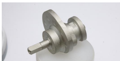
▲This cam was machined in 4 parts but now made by MIM as 1 part, thus cutting costs dramatically

When we do MIM, using the same technique as in resin moulding, a mixture of resin and metal powder is injected into the mould, giving us the shape. In the case of MIM the same problems arise as when we do resin moulding, for example parting lines, jetting and sink marks will appear on the parts. Even when doing MIM, it is important to consider how to prevent these problems at the design stage.