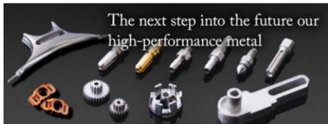
The next step into the future our high-performance metal