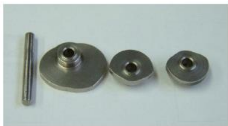
machined and assembled.

Generally, production cost increases in proportional to square of the number of sub-parts. By reducing the number of sub-parts, cost may be reduced easier and quality may be improved. Integration is one of the advantages of MIM. Several sub-parts may be formed into one integrated part by MIM. Manufacturing cost of complex parts may be reduced significantly but depending on the geometry.