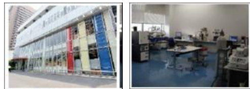
Every product is inspected for assurance of high quality.

We have a research laboratory in Japan. Several unique facilities are installed there, such as scanning electron microscope (SEM), X-ray CT scanner, micro injection machine and so on. Highly precise MIM process is under development. We would welcome your visit.