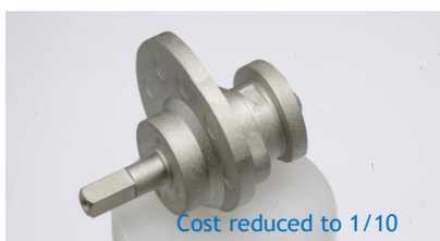
Cost reduced to 1/10

Please ask us for net shape production of parts with high accuracy.