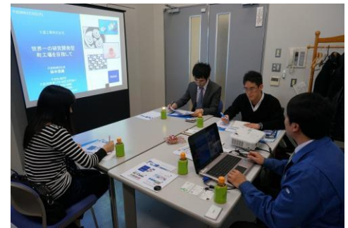
▲ Our employees (right) and the students

The overriding goal of this internship was for them to experience the enjoyment and fascination of technology research and manufacturing.