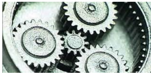
Application example (1): Helical gear with external teeth

Downsizing from the conventional method, shapes that are difficult to machine and achieving lower costs with MIM technology Mass production of very small metal gears is one of the major applications of MIM. This is because, since MIM uses moulds in production, and is excellent in mass production, then within the scope of what can be handled using moulds and moulding techniques (insert moulding, the use of sacrificial resin moulds, two-colour moulding or the like) it is able to handle shapes that cannot be handled by machine processing. In this article, we will introduce major applications of these MIM-made gears.