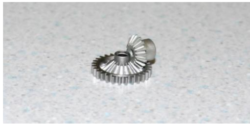
▲ Miter gear and bevel gear

Accordingly, even with mass production of a thousand or ten thousand units, costs cannot be held down at a realistic amount.